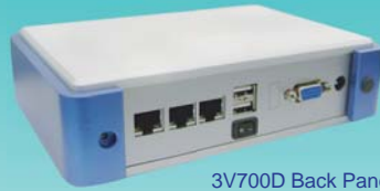
3V700D Back Panel