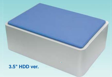
3.5" HDD ver.