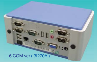
6 COM ver. ( 3I270A )