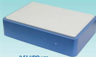
2.5" HDD ver.