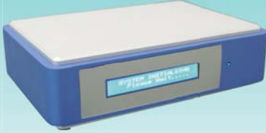
LCM ver. ( 3V700D / 3I270D )