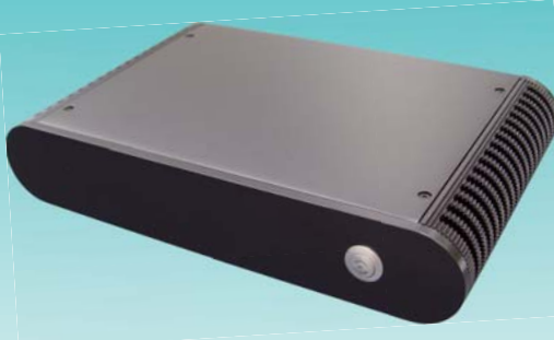
Hole-less version is only for CI270C / MI270A