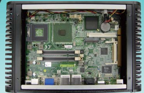
NEO Chassis without top-cover

Application : Thin Client, Network device, Set-Top Box, VPN, VOIP, DVR and POS system