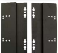
System Wall Mount Kit