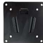
VESA Mounting Kit