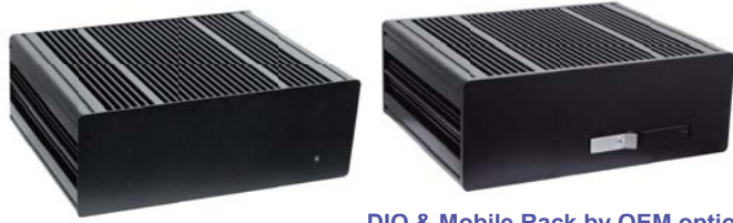
DIO & Mobile Rack by OEM option.

Fanless Embedded Computer with 13th Gen Intel® Raptor Lake-U/P Processor